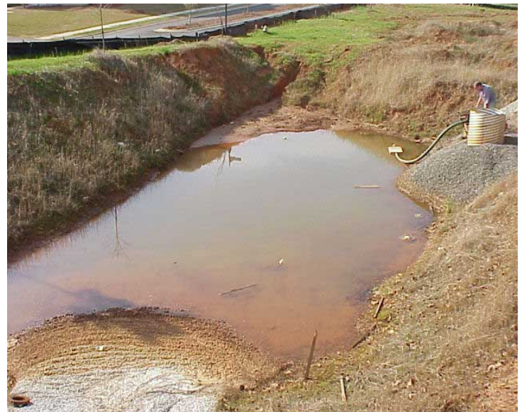
The sediment had been given time to settle out, leaving only very fine particulate suspended in the pond

David and Joe wanted to start fixing the problem at the source instead of just cleaning up the effects of poor erosion control. If they didn't stabilize the soil at the source, they would continue to have problems after every rain event. They planned to stabilize the slopes by grassing them, install more silt fence, and clean out the sediment ponds.