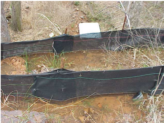
The water running off the jute fabric and through the silt fence is clear water measuring 15 NTU.

The first pond contained about 14,000 gallons of water had an initial turbidity of 400 NTU. It was pumped out at a rate of 130 GPM with the final turbidity reading as the water left the jute field and went through the silt fence of 20 NTU. This is a 95% turbidity reduction.