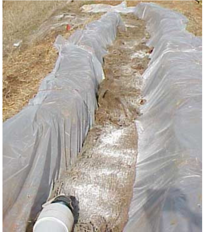
The ditch was made with two rows of straw bales covered with plastic and lined with two layers of an open-weave jute matting sprinkled with the appropriate Silt Stop® powder.

The jute matting was sprinkled with APS 712 Silt Stop powder to enhance the particle collection, and the jute matting was run all the way down the hill to the double row of silt fence just above the creek. The plastic sheeting in the ditch prevented the highly erosive fill soil from being carved out and carried away by the water in the ditch. The Silt Stop treated jute matting protected the soil going down the slope, as the matting stuck to the soil surface and prevented it from washing away.