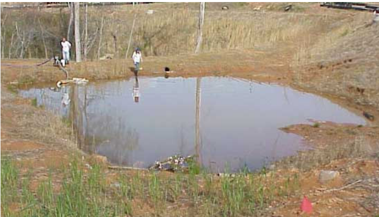
Around the ponds was mostly bare soil with no temporary grassing

The first step was to pump the water out of two of the small sediment ponds. APS 703d and APS 706b Floc Logs were used together to treat the suspended sediment in the water as it was pumped out of the pond, clarifying the water enough that it could be discharged directly into the nearby creek.