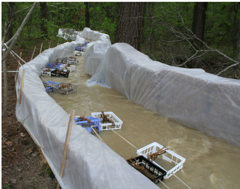
The soil-specific Floc Logs were secured into plastic crates in the mixing/reaction portion of the treatment system where the polymer would react with suspended sediment.

With the possibility of fines for violations of discharge limits the contractor was urged to consider the use of polymers as part of the corrective actions to be taken. The contractor turned to the expertise of Applied Polymer Systems and Jen Hill for help to get the project back on track. Samples of the turbid water in the stilling pond were sent to APS labs to find the exact soil-specific polymers to treat the water. After consulting with Applied Polymer Systems and Jen Hill, a polymer enhanced flow-through chemical treatment system was designed to safely convey and treat the water coming from the stilling pond on its way back to the lake.