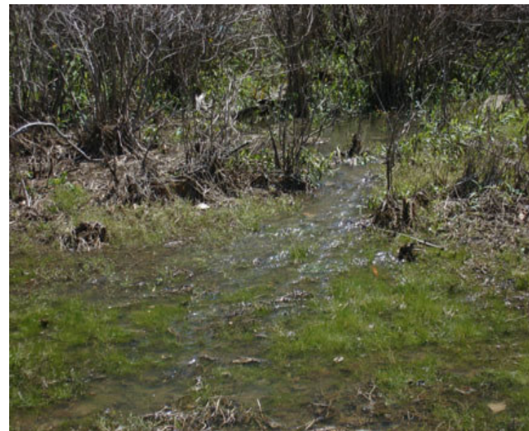
The clarified water re-entered Kentucky Lake without any turbidity impacts.

The dispersion field was stabilized with a Soft Armoring technique. Open-weave jute matting was laid in the dispersion field and applied with the appropriate soil-specific Silt Stop powder. The jute fabric provided a surface area for the reacted particulate to adhere to while providing structural support to the underlying soil surface to prevent erosion. The Silt Stop powder enhanced the particle collection capabilities of the jute matting and bound the jute matting to the soil surface to prevent cutting in the forest floor.