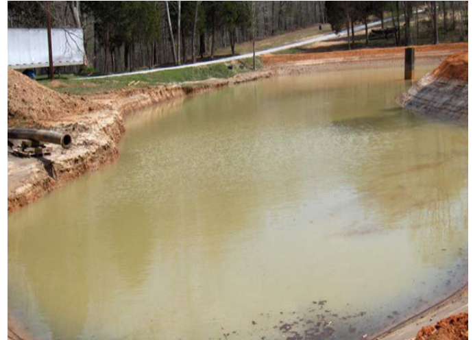
The dredge spoils discharged into the stilling pond through the pipe on the left and discharged through the riser pipe on the right.

The plan was to dredge out the cove and deposit the spoils into a large stilling pond where the sediment would settle out. The excess water would discharge from the pond, filter through a wooded area, and eventually return to the lake. The wooded land belonged to the Tennessee Valley Authority (TVA), and they had the project shut down over concerns of elevated sediment loads in the water returning to the lake as well as erosion through the woods due to the high volume and velocity of the discharged water.