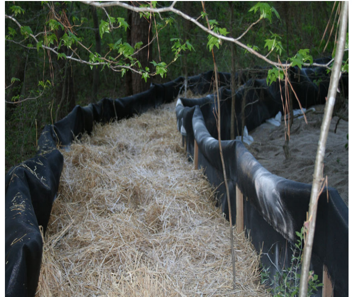
The treated water passed across the jute dispersion field before passing through the sediment retention barrier filled with straw and polymer where final polishing occurred.

After treatment and particle formation, the water discharged into a dispersion field where it spreads out and slowed down in a stabilized area. The particles that had formed in the reaction portion were collected and removed, allowing clarified water to return to the lake. By reducing the velocity, the erosive potential of the flowing water was greatly reduced to minimize the disturbance to the vegetated areas.