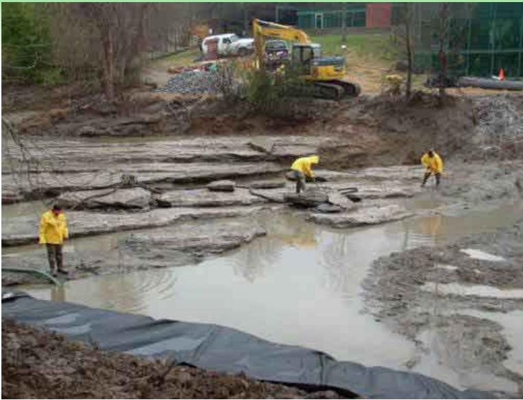
Pumping off of excess water to expose the sediment before removal.

To start, the upstream water was re-routed back into a wetland through the Zoo's pumping system, effectively creating a zero-flow environment at the pond site. Each day the pumps were started early and the clean water discharged over the Floc Logs to remove the suspended solids before diversion into a stormwater detention area, built with Jen-Hill flex max gabions, that had been constructed previously as part of the requirements for the Elephant exhibit. Floc Logs were also used to stabilize the spring-fed stream pouring the organic materials into the Croft Pond, as well as the stormwater ditch flowing into the site.