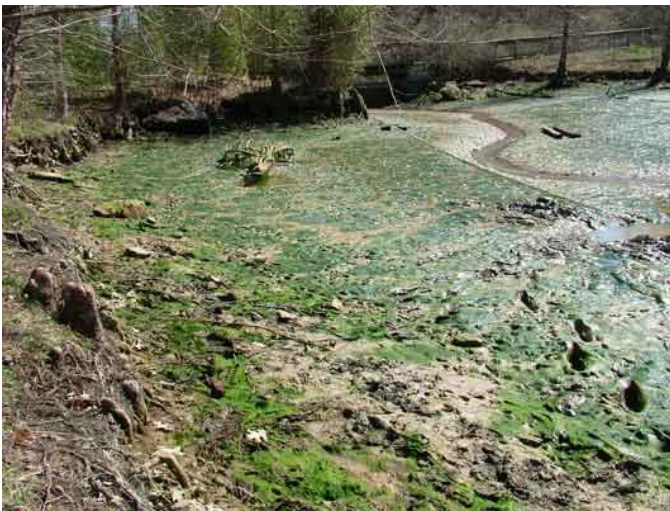
Croft Pond, once drained revealed 8 feet of sediment.

But before repairs could be made, the sediment needed to be removed. However, the soupy mess that was left at the bottom of the pond would be extremely difficult to remove with conventional methods. It was estimated that there was 7000 tons of sediment to be removed, covered by 3 feet of water. Kevin Surprise, of 5K Construction, found that large excavating equipment could not be used, as there was limited access to the pond due to the zoo's surrounding walkways.