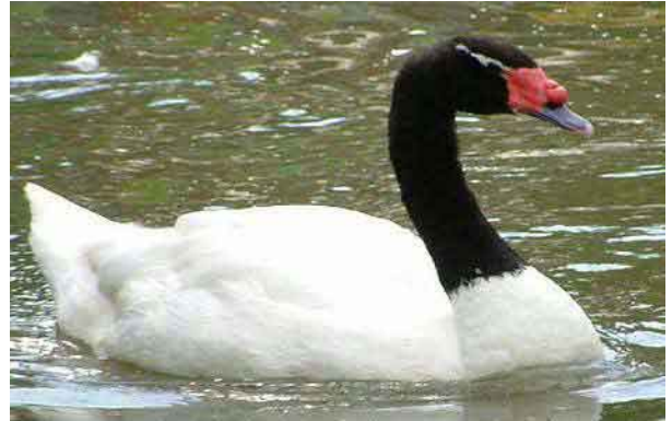
A Black Neck Swan, one of the current residents of Croft Pond.

Historically the Croft Pond has water quality problems due to low flow in the summer, leaks, a contaminated spring, and stormwater run-off from an industrial park. In 2004 Rick Schwartz, the President of Nashville Zoo, had contacted Jen-Hill to make repairs twice to try and seal the dam unsuccessfully. Bald Cypress roots, Rivercane roots, and Muskrats had allowed avenues to develop outside the concrete boundaries, causing additional problems.