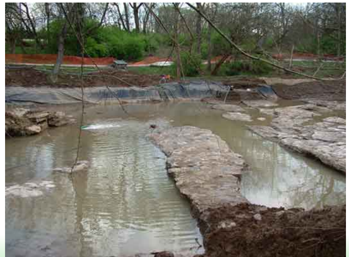
The uneven terrain provided a challenge to the machinery.

Applied Polymer Systems, Inc. 519 Industrial Drive Woodstock, GA 30189 678-494-5998