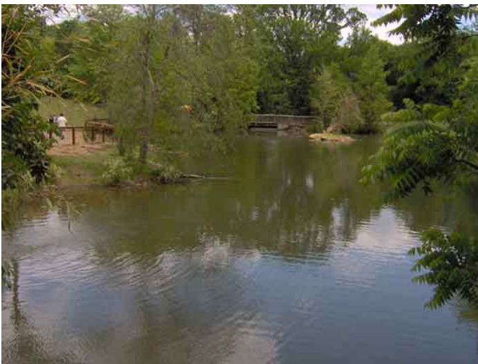
Project Complete: Croft Pond, fully restored.

After 2 hours of dewatering each morning, sediment removal would begin on the areas isolated and stabilized using APS Silt Stop powder the afternoon before.