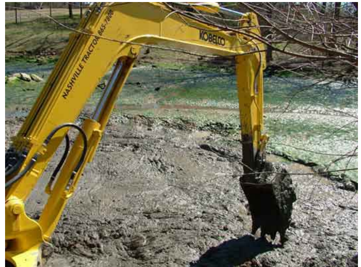
APS Silt Stop solidified the sediment for easier removal.

For this project, 250 pounds of APS 705 & 712 Silt Stop powders were used, along with 8 APS 703d Floc Logs. The project cost over $130,000 and took 28 days to complete while the zoo remained open. This saved the zoo a fortune, as there was realistically no other way to do the project between the constraints of the limited access to the site, and keeping the rest of the zoo fully operational.