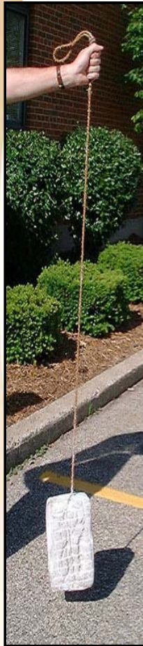
Standard Floc Log

Literally thousands of applications occur each year in which a pump draws turbid water from a construction site pond, basin or foundation excavation ... and, without clarification, discharges the water into a storm sewer, ditch, wetland, lake and other 'convenient' location. In many cases, this practice damages the environment, generates ill-will, invokes legal fees, extracts monetary penalties and/or breaks the law. However, until polymer use was accepted by MDEQ, reasonable cost and performance qualified alternatives to discharging poor-quality water simply did not exist. Now, with polymer acceptance and proper use, discharges of high-quality pumped water are both simple and economical.