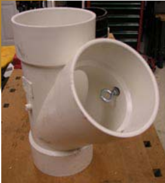
Figure 2: Wye with 5/16" eye-bolt installed