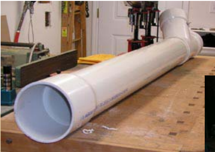
Figure 4: Floc Log 'Housing'