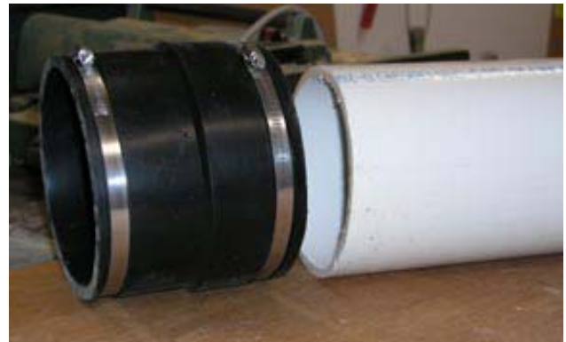
Figure 6: Housing to Down-Gradient Corrugated HPDE Pipe

A sufficient length of 6" PVC is needed down-gradient from the wye to 'house' one or more Floc Logs [Figure 4]. Typically, two Floc Logs will fit into a 5' pipe length. Because greater efficiency is developed when polymer introduction is spaced out along a system, we anticipate that, at most, each wye introduction system will host a maximum of two Floc Logs . Given a maximum discharge rate of 450 gpm for a 4" pump, a total system may include up to 4 wyes and eight Floc Logs . 2" and 3" pump systems require fewer wyes and Floc Logs .