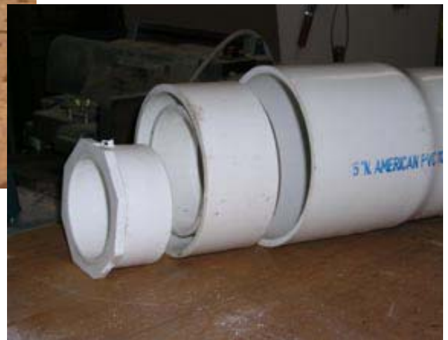
Figure 5: Housing to Down-Gradient PVC Pipe

Contact your Price and Company, Inc. Regional Representative for more information on how to set up an efficient and effective small-pump water clarification system.