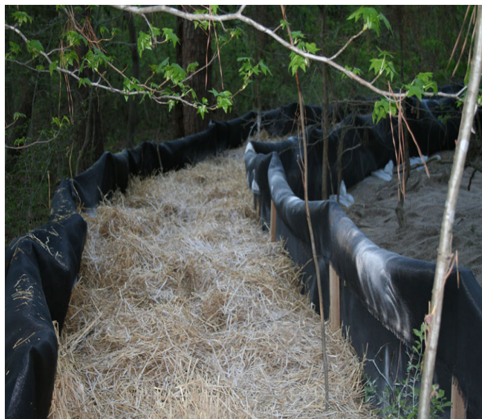
The treated water passed across the jute dispersion field before passing through the sediment retention barrier filled with straw and polymer where final polishing occurred.

After treatment and clarification, the water discharged into a dispersion field where it spreads out and slowed down in a stabilized area before being allowed to re-enter Kentucky Lake. The particles that had formed in the reaction portion were collected and removed, allowing clarified water to return to the lake. By reducing the velocity, the erosive potential of the flowing water was greatly reduced to minimize the disturbance to the vegetated areas.