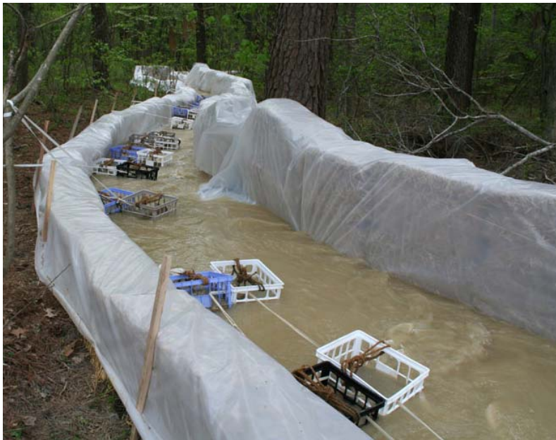
The soil-specific Floc Logs were secured into plastic crates in the mixing/reaction portion of the treatment system where the polymer would react with suspended sediment.

With the possibility of fines for violations of discharge limits the contractor was urged to consider the use of polymers as part of the corrective actions to be taken. The contractor turned to the expertise of Applied Polymer Systems and Jen Hill for help to get the project back on track. Samples of the turbid water in the stilling pond were sent to APS labs to find the exact soil-specific polymers to treat the water. After consulting with Applied Polymer Systems and Jen Hill, a polymer enhanced flow-through chemical treatment system was designed to safely convey and treat the water coming from the stilling pond on its way back to the lake.