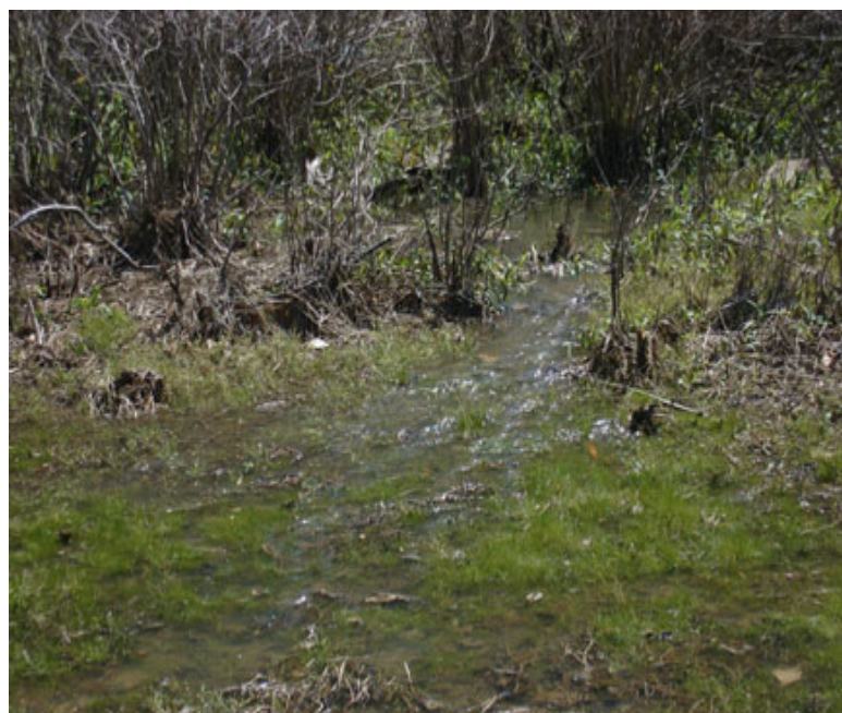
The clarified water re-entered Kentucky Lake without any turbidity impacts.

The treatment ditch discharged into a dispersion field lined with open weave jute matting applied with the appropriate soil-specific Silt Stop powder. The jute fabric provided a surface area for the reacted particulate to adhere to while providing structural support to the underlying soil surface to prevent erosion or cutting in the forest floor. The Silt Stop powder enhanced the particle collection capabilities of the jute matting. The water spread out and slowed down as it was discharged into the 8,100 sq. ft. dispersion field, ringed by a polymer enhanced Sediment Retention Barrier (SRB). The water pooled in the dispersion field, slowly filtering through the SRB and releasing at a greatly reduced velocity and returned to Kentucky Lake.