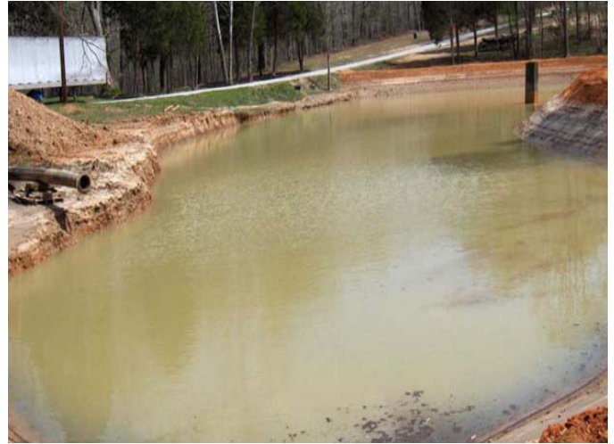
The dredge spoils discharged into the stilling pond through the pipe on the left and discharged through the riser pipe on the right.

The plan was to dredge out the cove and deposit the spoils into a large stilling pond where the sediment would settle out. The excess water would discharge from the pond, filter through a wooded area, and eventually return to the lake. The wooded land belonged to the Tennessee Valley Authority (TVA), and they had the project shut down over concerns of elevated sediment loads in the water returning to the lake as well as erosion through the woods due to the high volume and velocity of the discharged water.