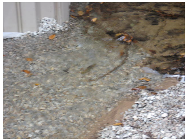
Adult spawning salmon are seen moving upstream through the diversionary channel all the while the box culvert is being installed.