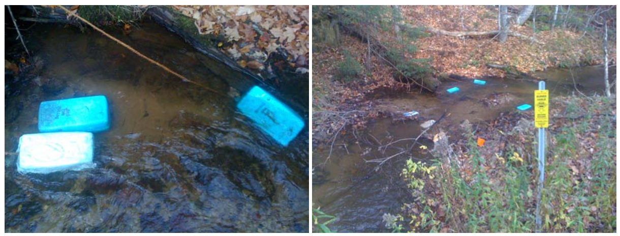
Floc Logs can be seen in the stream preventing turbidity migration.