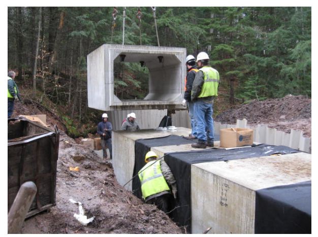
Assembly of the new box culvert is continued