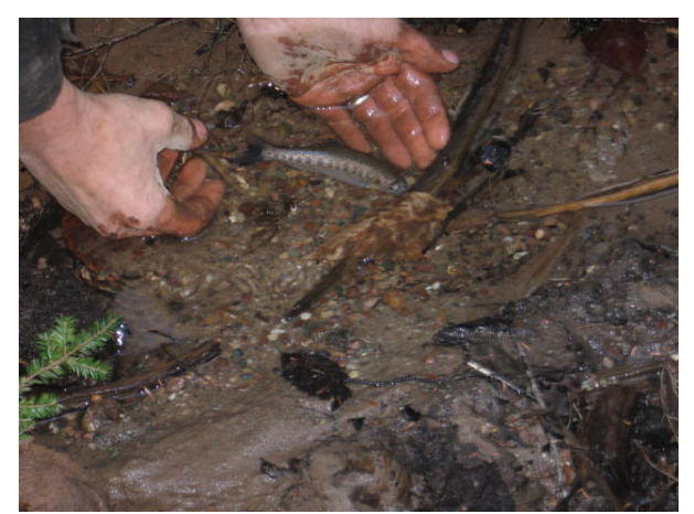
Within minutes of opening the diversionary ditch, small salmon were seen swimming in the diversion channel.