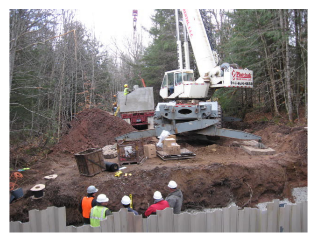
The installation of the new box culvert is beginning.