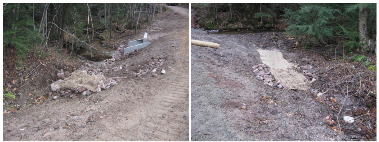
Polymer enhanced rock check systems were installed along the ditch lines.