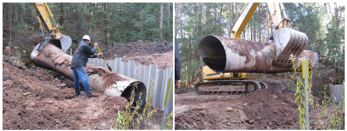
With all of the water diverted, the old culvert could now be removed.