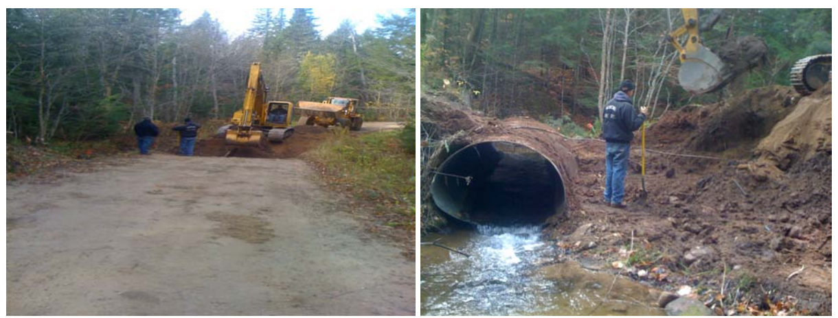
This is the beginning of the removal of the old culvert using an excavator.

The Anna river culvert replacement project took five (5) days to complete. A snow event occurred on the seventh day following completion of the project. The soft armoring and stabilization held throughout the winter months under the snow cover. During the spring breakup there was no erosion, sediment loss or rills and gullies formed. The Anna River project was a great success with newly established grass and clear water running down river. A highlight to the overall success was that there were no impacts or effects to the salmon run during the course of the construction.