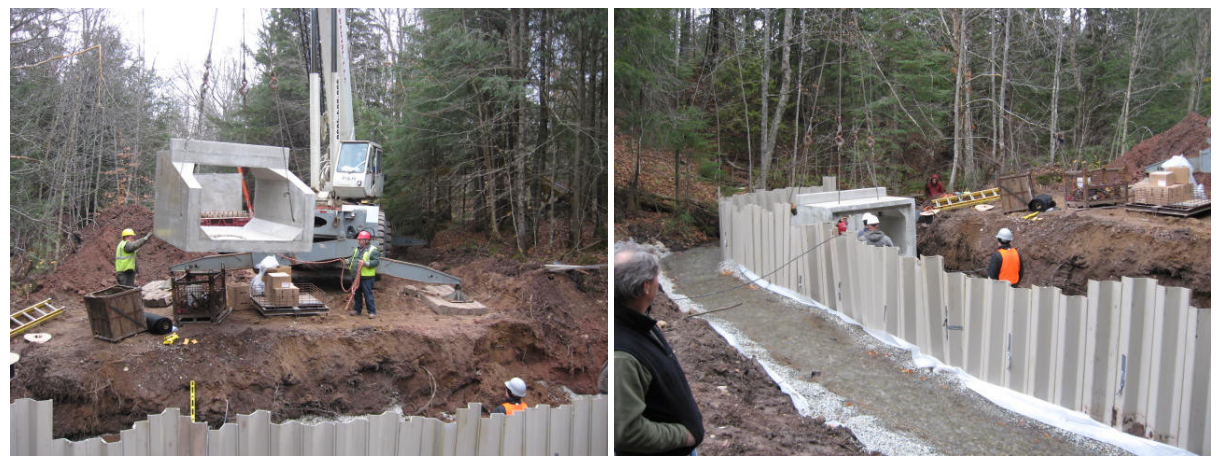
Placement and assembly of the new box culvert is in progress.