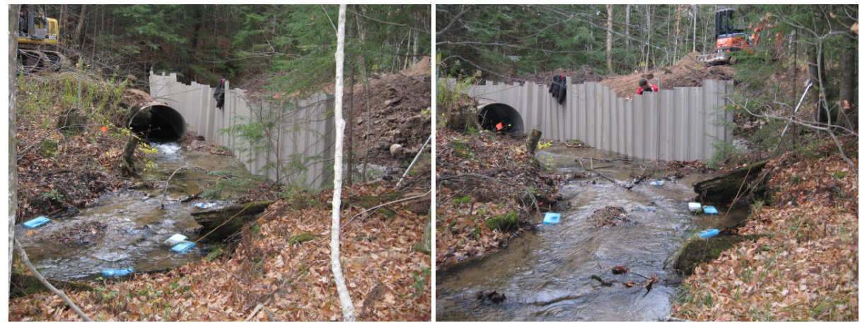
Floc Logs were placed downstream from the activity to treat any turbidity that is created from the disturbance. The sheet pilings were used to create the stream diversion separating the construction from the stream flow. An excavator was used to put the sheet pilings in place. slotting them together.