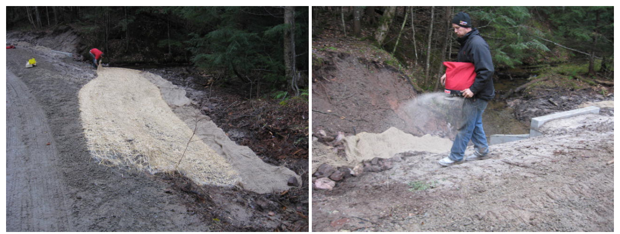
The polymer mixture was spread on all the soil that was disturbed. The polymer not only stabilized the soil but prevents the seed and fertilizer from washing into the stream.

The mixture of the polymer, seed and the fertilizer was loaded into a spreader.