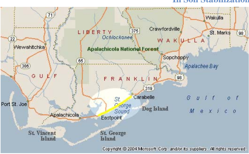
This 14 mile stretch of Highway 98 along the coast was the project area.

On July 10, 2005 Hurricane Dennis raged through the Florida panhandle near Apalachicola and St. George's Island. It made landfall at 3 pm as a category 3 hurricane; with a maximum sustained wind near 140 mph and wave heights of 6 to 8 feet. US highway 98, a major tourism and transportation corridor that follows along the panhandle's coastline, felt the brunt of the hurricane's forces.