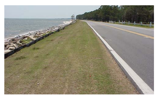
The shoulder of Highway 98, over 8 months after the application, is still stabilized and has held up to the extreme weather conditions of the Florida coast.