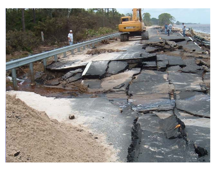
The movement of the highly erosive beach sands caused the roadway to collapse, in some places across the entire width of the two lane road.

Damage was severe on approximately 14 miles of US highway 98, ranging from erosion of the shoulder to buckling and subsidence of the entire roadway. Immediately after the storm, the Florida Department of Transportation (FDOT) took action to reconstruct and open traffic on the stretch of damaged highway, awarding a construction contract to complete emergency repairs within 14 days. The travel lanes were quickly reconstructed and traffic soon resumed; however, within a month shoulder erosion was reoccurring, threatening to again encroach on travel lanes.